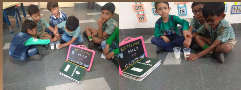
Learning permanent change