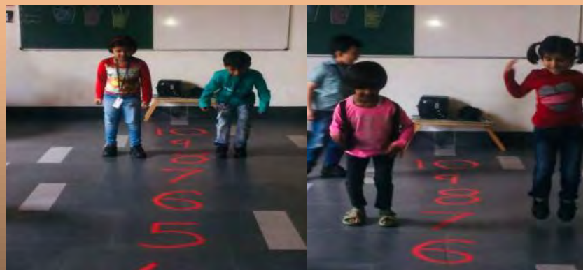
Hip and Hop – Fun way of learning Reverse counting