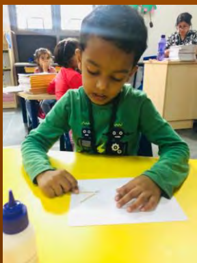
Learning primary to secondary colours