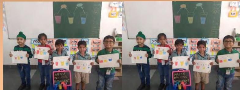
Water travelling activity, reflection – Primary to Secondary colours