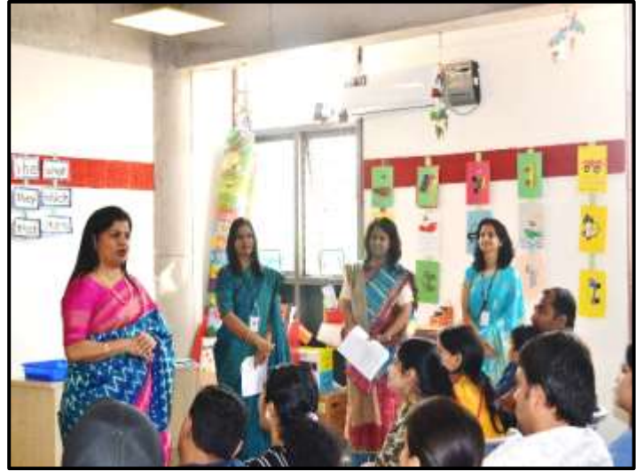
All apprehensions put to rest