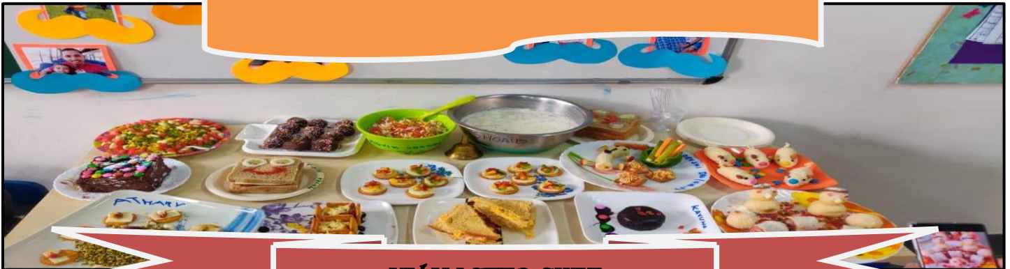
MY MASTER CHEF