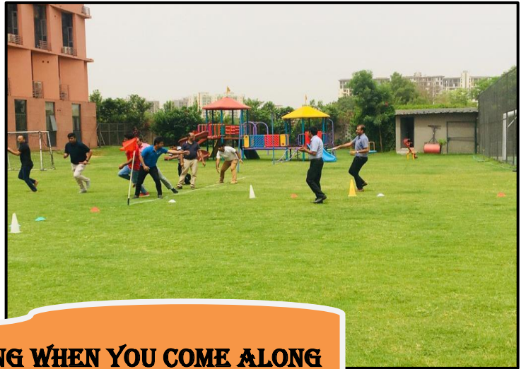
NO ROAD WILL BE LONG WHEN YOU COME ALONG