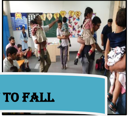
YOU LIFTED ME WHEN I WAS ABOUT TO FALL