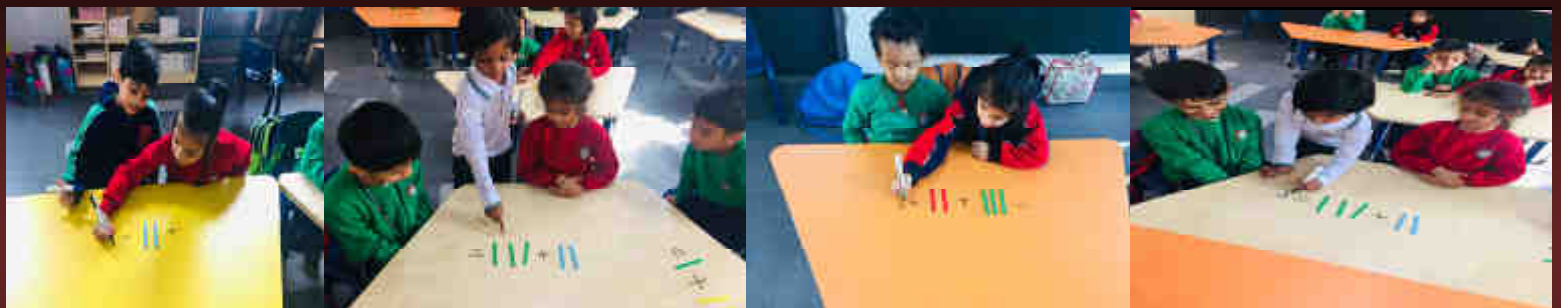
Addition was fun when students learnt to calculate using sticks.