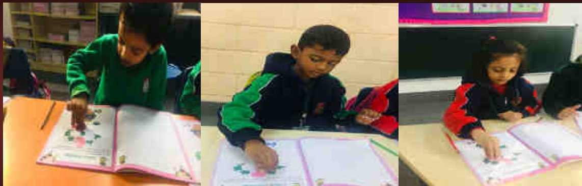
Students did onion printing to make flowers. This activity helped them to learn eye and hand coordination.