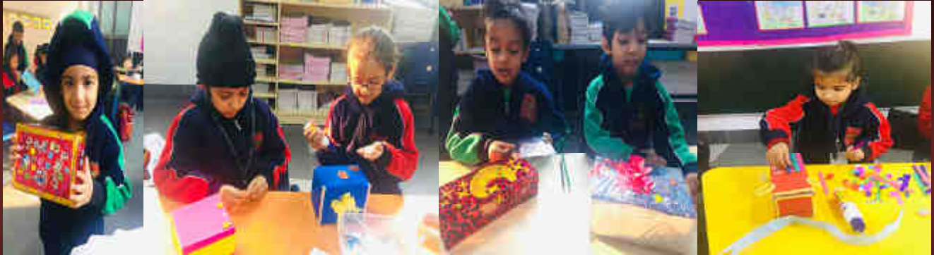
Students enjoyed gift decoration activity for Charismas. They kept their gift boxes near the tree to gather lots of gifts from Santa.