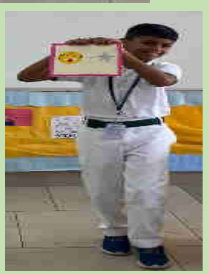
DELHI PUBLIC SCHOOL, SECTOR-84 GURUGRAM