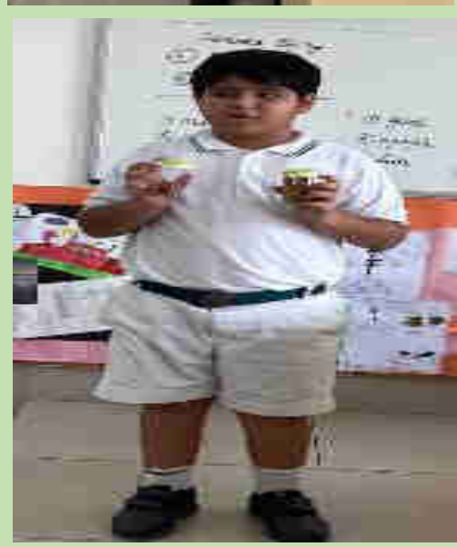
DELHI PUBLIC SCHOOL, SECTOR-84 GURUGRAM