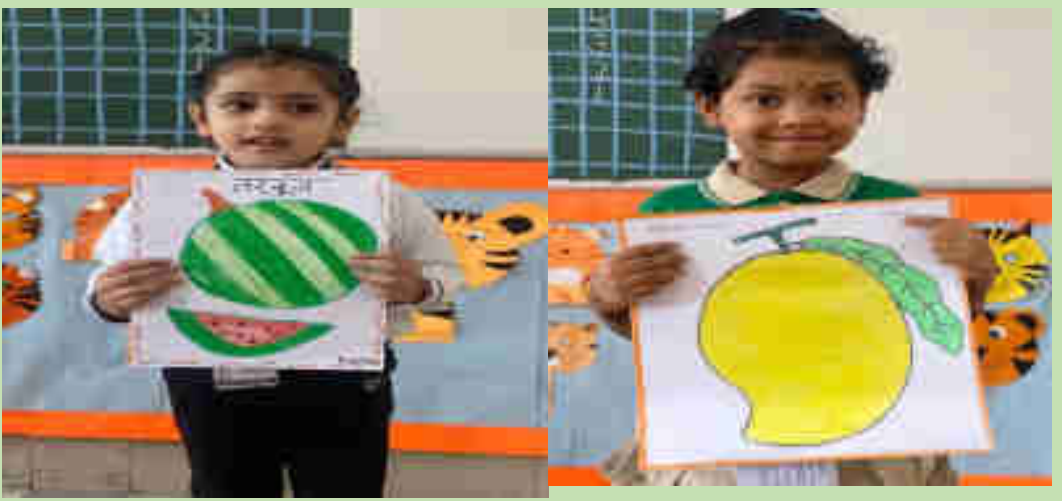
DELHI PUBLIC SCHOOL, SECTOR-84 GURUGRAM