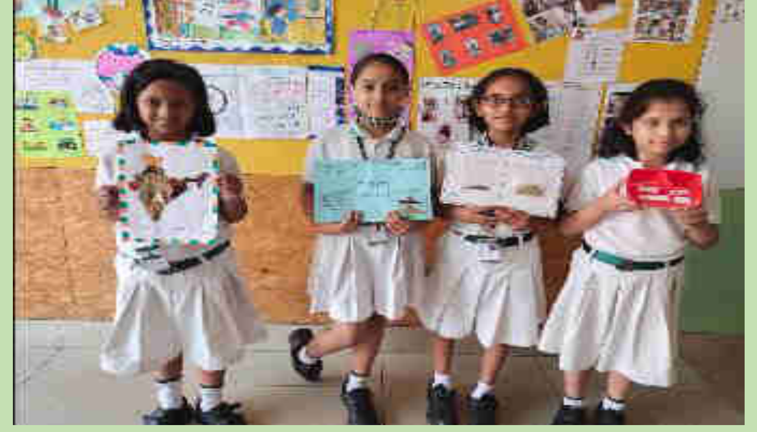
DELHI PUBLIC SCHOOL, SECTOR-84 GURUGRAM