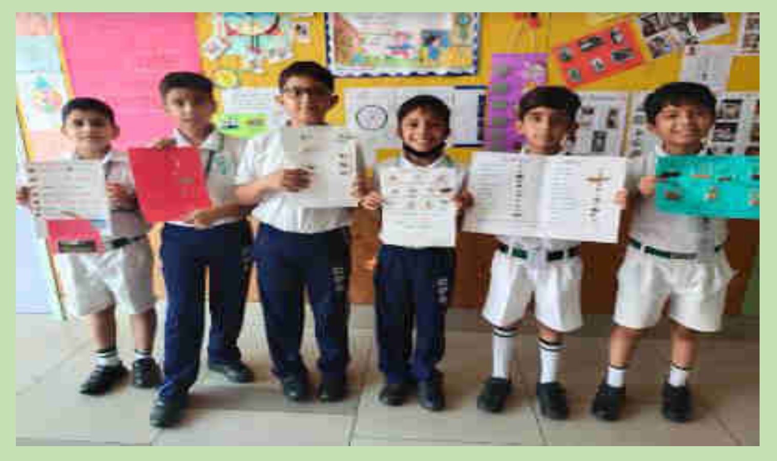
DELHI PUBLIC SCHOOL, SECTOR-84 GURUGRAM