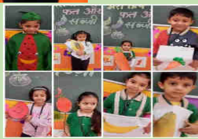
DELHI PUBLIC SCHOOL, SECTOR-84 GURUGRAM