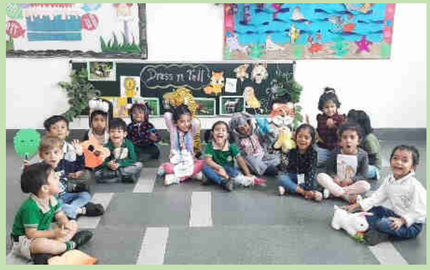
DELHI PUBLIC SCHOOL, SECTOR-84 GURUGRAM