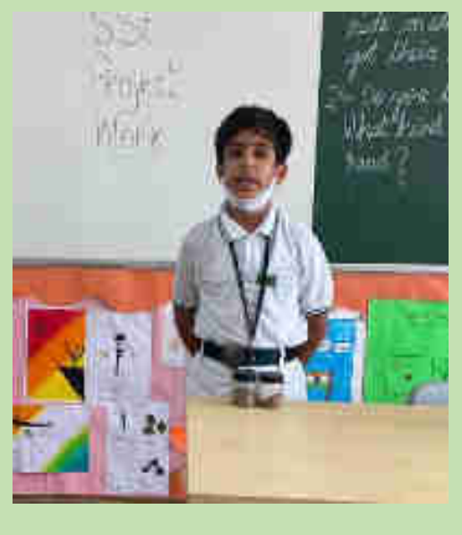
DELHI PUBLIC SCHOOL, SECTOR-84 GURUGRAM