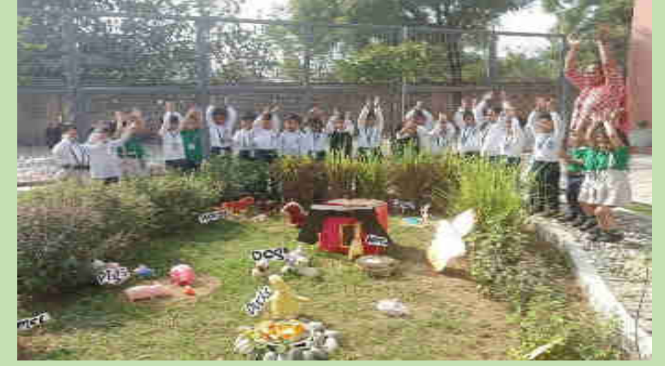
DELHI PUBLIC SCHOOL, SECTOR-84 GURUGRAM