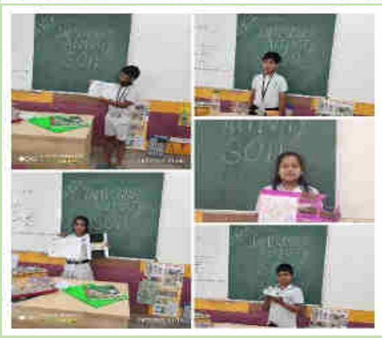
DELHI PUBLIC SCHOOL, SECTOR-84 GURUGRAM