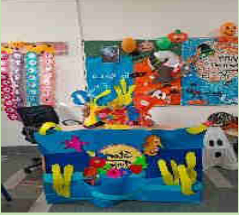
DELHI PUBLIC SCHOOL, SECTOR-84 GURUGRAM