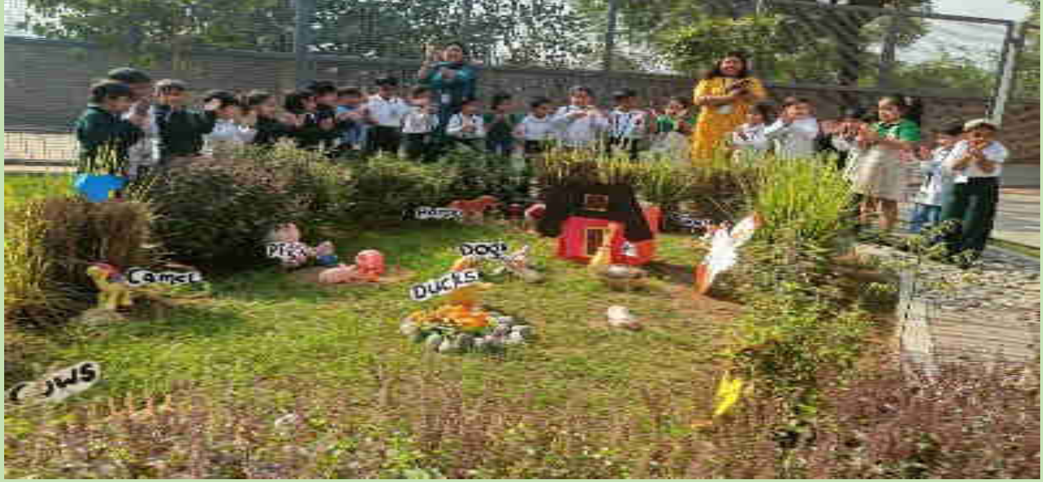
DELHI PUBLIC SCHOOL, SECTOR-84 GURUGRAM