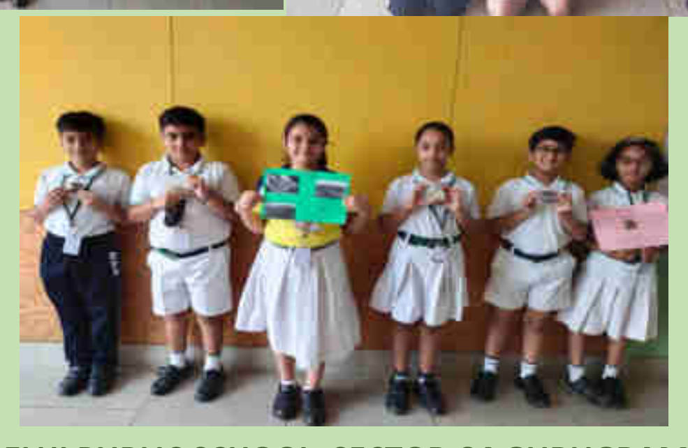
DELHI PUBLIC SCHOOL, SECTOR-84 GURUGRAM