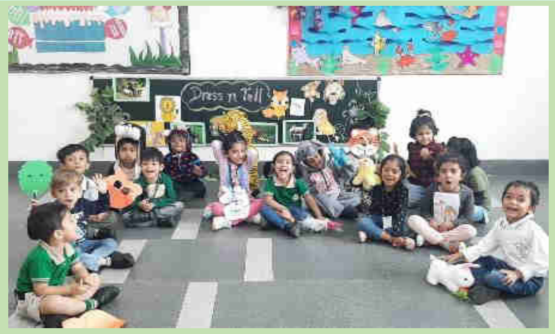
DELHI PUBLIC SCHOOL, SECTOR-84 GURUGRAM