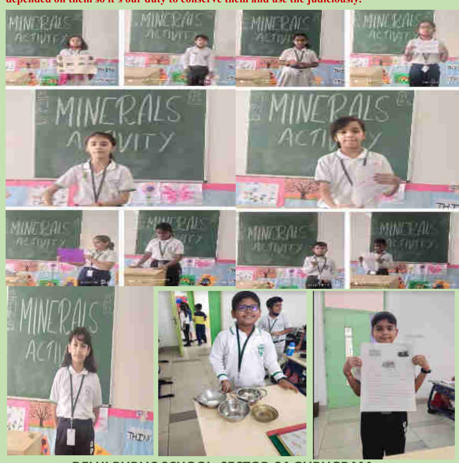
DELHI PUBLIC SCHOOL, SECTOR-84 GURUGRAM

Students have studied about mineral resources and their types, metallic and non-metallic minerals. They were asked to look around at home and list any ten objects made of metals and their alloy. They were made aware about the use of these minerals and how much are we depended on them so it's our duty to conserve them and use the judiciously.