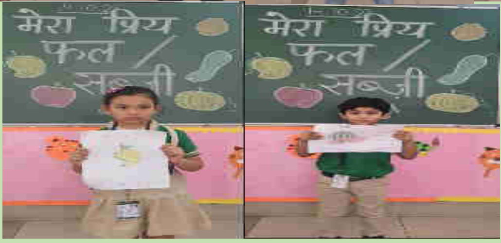
DELHI PUBLIC SCHOOL, SECTOR-84 GURUGRAM