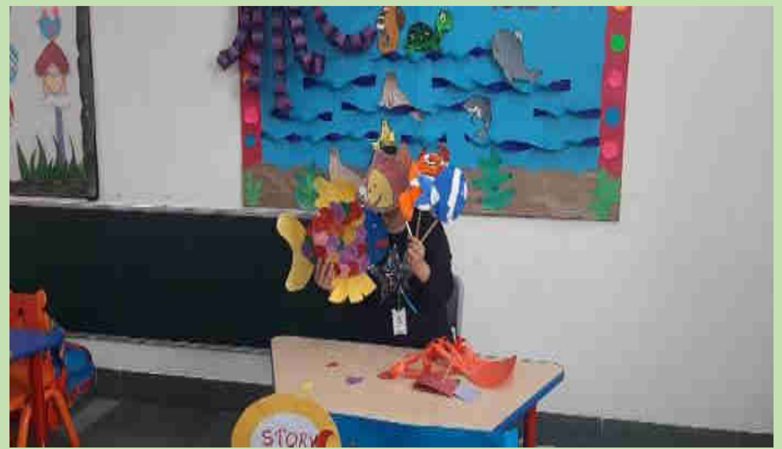
DELHI PUBLIC SCHOOL, SECTOR-84 GURUGRAM