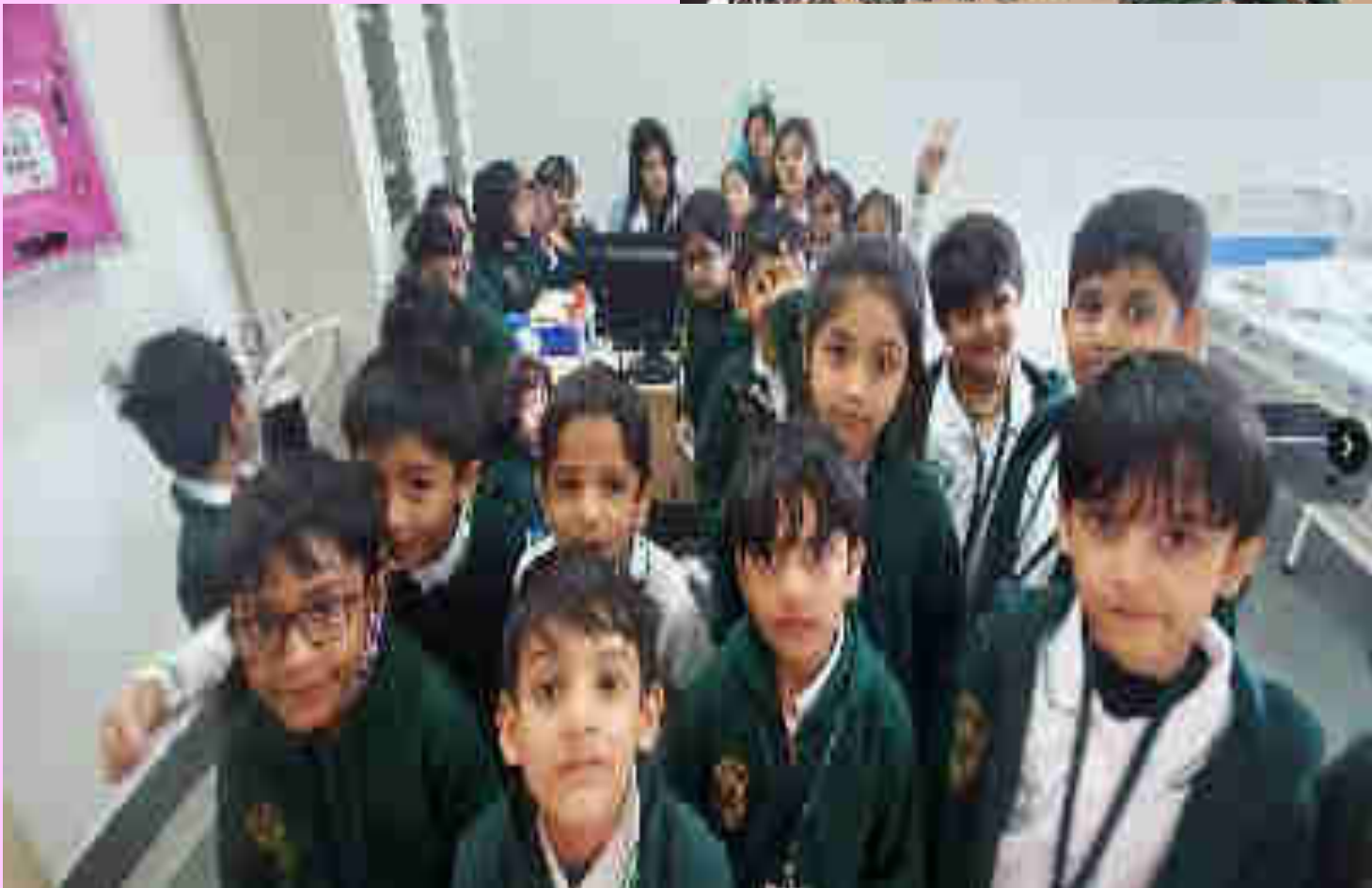
DELHI PUBLIC SCHOOL, SECTOR-84 GURUGRAM