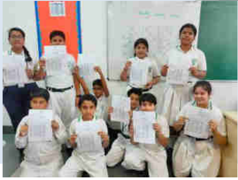
DELHI PUBLIC SCHOOL, SECTOR-84 GURUGRAM