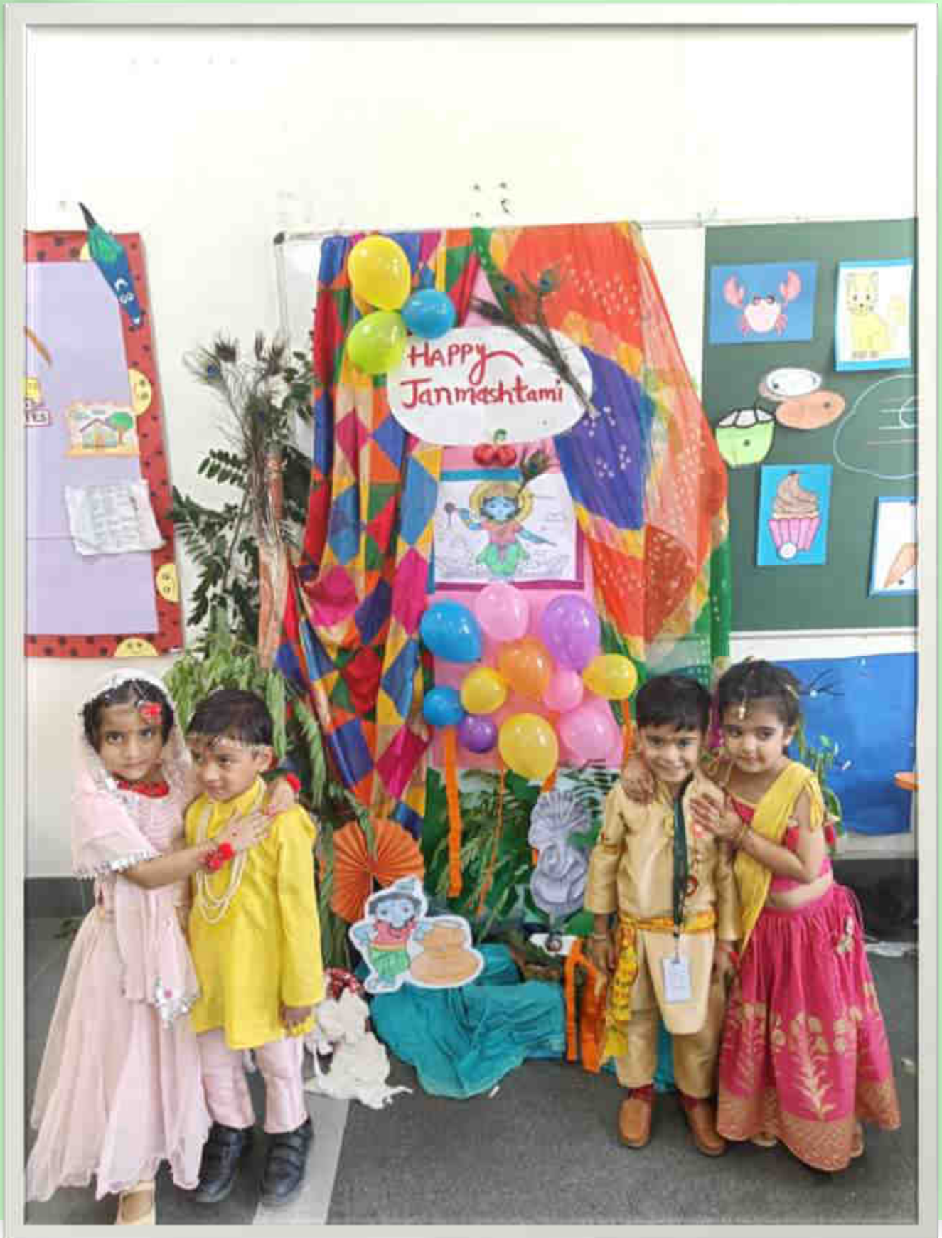
DELHI PUBLIC SCHOOL, SECTOR-84 GURUGRAM